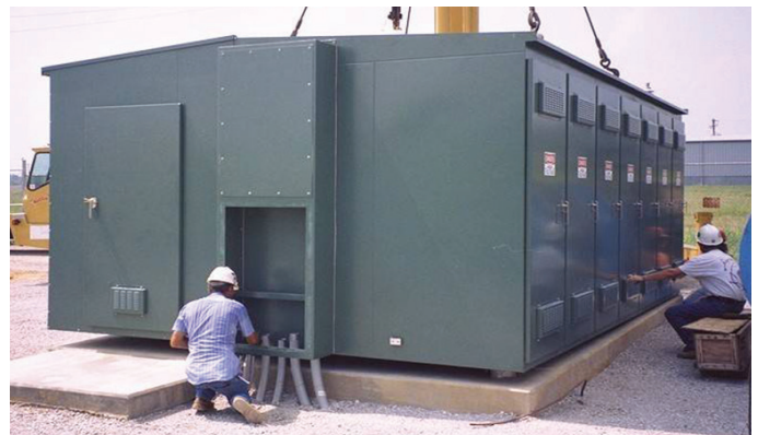
Our Field Services Team provides unmatched service and experience