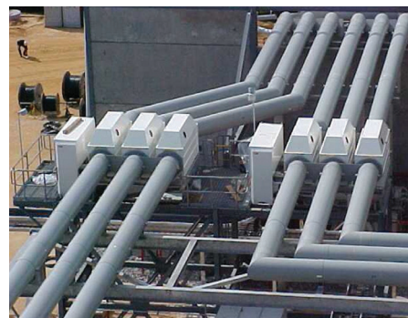
Avail Isolated Phase Bus System technology reduces enclosure voltage and is the safest for personnel and equipment.