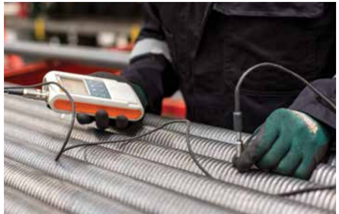
Inspection of the 360 tubes