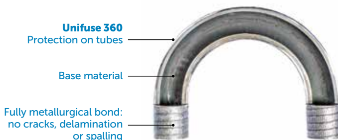
Cross-section of a bent tube