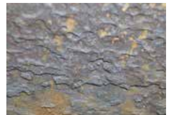
ID cladding defects, CUI, corrosion and cone erosion