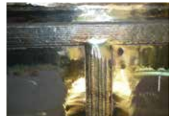
Seam crack repair and reinforcement band