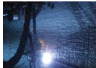
Bulge repair and structural reinforcement