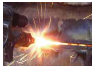
Cone and head removal, repair and reinforcement