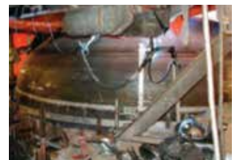
Weld overlay for build up and material upgrading