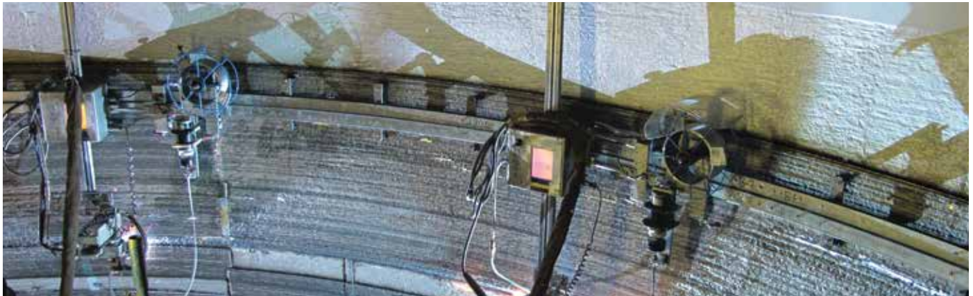
Structural reinforcement of a Delayed Coker Unit