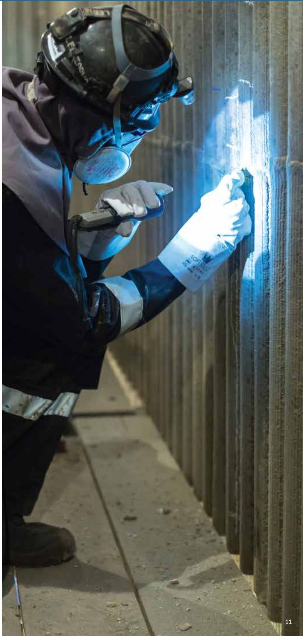
Field inspection of existing overlay

A tailored maintenance program is the most cost-effective way to protect your asset. During the maintenance program, we monitor the performance of your assets on a regular basis.