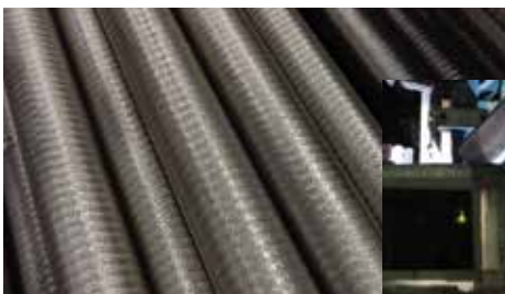
Unifuse 360 - Boiler tube protection

The Unifuse 360 process provides 360° protection for boiler tubes from corrosion and erosion. Our facility can apply an overlay thickness of 1,2-3,0 mm (or even more if required with multilayer overlay) for tube designs and headers up to 15 m long with diameters between 21–273 mm.