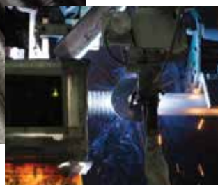
Unifuse 360 Our unique GMAW/GTAW process