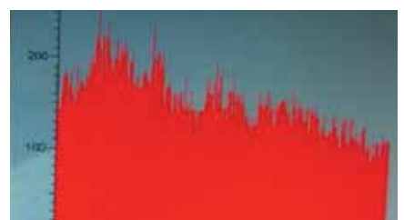
Qualitative and quantitative (energy dispersive X-ray) analysis