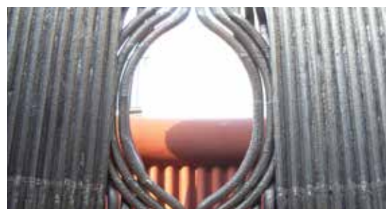
Spiral tubes with windows