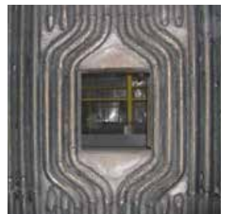
Spiral tubes with openings