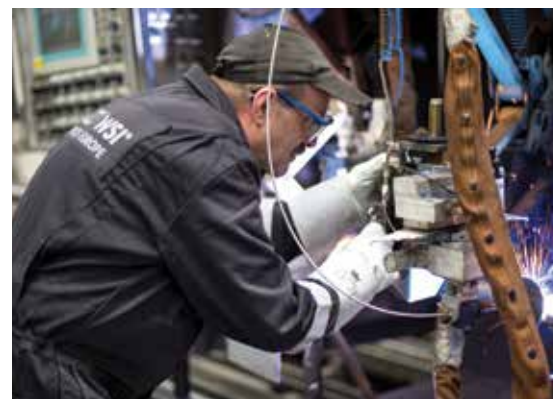
Unifuse® 360 tube line