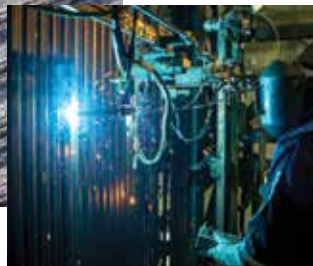
Unifuse 180 Overlay of flat straight panels