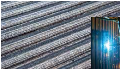
Unifuse 180 - Boiler panel life extension

The Unifuse 180 process delivers high-quality surface protection for panels. Our equipment facility include GMAW technology and panel mounting systems that feature the ability to overlay flat panels up to 18 m long and 2 m wide.