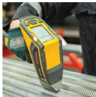
PMI for dilution control