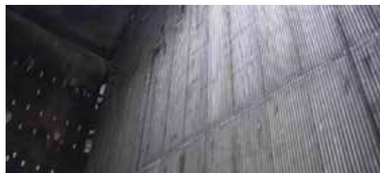
The WSI repair with Unifuse 622 extended the lifetime of the coal-fired boiler