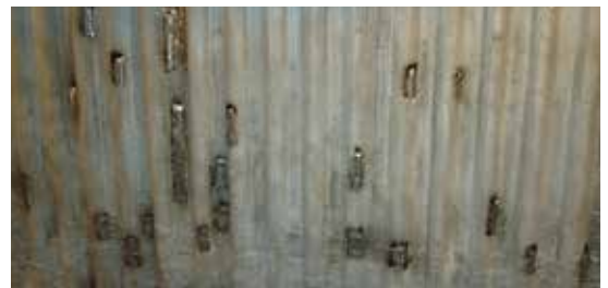
Spot repairs on an old 625 weld overlay