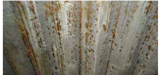
Waterwall after copper sulfate test

Our services guarantee accurate adherence of the protection to the tubes and flat bar membranes that have been applied with the corrosion-resistant alloy. Warranties from the date the overlay will be exposed to fire/flue gas can be supplied. These warranties are subject to agreement following receipt of the overlay parameters to which the overlay is exposed. Our evaluation takes account of all the relevant operational factors such as boiler type, flue characteristics, boiler operation conditions, and current tube conditions.