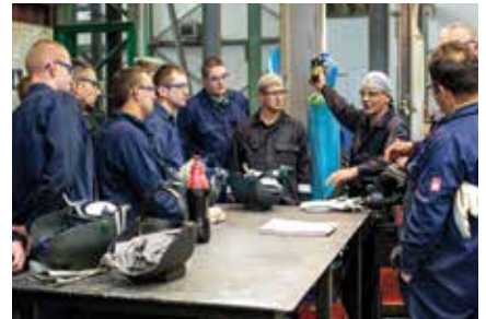
Daily safety meetings

Our automatic process delivers a high-quality weld overlay. The process qualification and parameters we have developed include destructive testing to check for weld overlay characteristics, such as dilution into the base material, which is precisely measured at all times by controlling the process parameters. It is also important to keep the Fe content from the base material at a minimum, as this is responsible for deterioration of the corrosion.