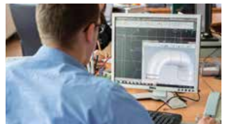
A complete range of analysis