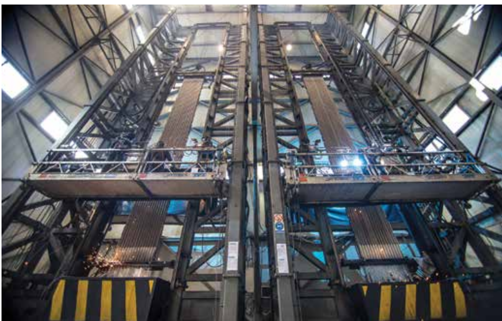
Boiler panel life extension

It is crucial to determine what kind of damaging process is affecting the asset. Weld overlay protection can wear down as time goes by and its longevity depends not only on the quality of the application but also on the operational conditions within the boiler. Highly localized temperature, turbulence, flue gas impingement, and ash may cause a reduction in the overlay service life. Unifuse delivers the best quality with the lowest dilution possible whether used in the build-up process to achieve minimum thickness recovery (assuring the restoration of the pressure wall) or whether applied as a corrosion-resistant overlay, allowing the boiler to operate in the most cost-effective way.