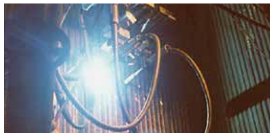
Field repair on a black liquor recovery boiler

Superheaters are typically made of carbon or Cr-Mo steels (e.g. ferritic steel: T11, T22). Rapid, high-temperature corrosion of these steel tubes can occur where there are high-heat areas. Combustion of the liquor yields an inorganic smelt which is rich in sodium carbonate ( \text{Na}_2\text{CO}_3 ) and sodium sulfide ( \text{Na}_2\text{S} ). Its combustion generates tube-wall thinning due to sulfidation in carbon steel carbonates and sulfides. Potassium salts may also deposit on tubes, smelt run floor, spout wall and primary airport openings and cause further corrosion.