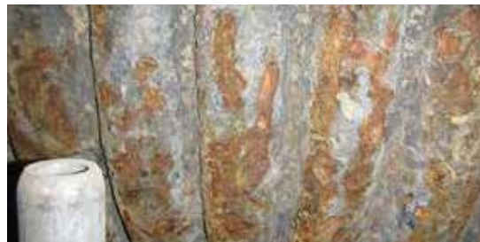
Fireside corrosion in a coal-fired boiler

WSI has been selected to provide weld metal overlay on many coal-fired boilers using Unifuse® 622. Unifuse with alloy 622 has a proven performance record against corrosion, corrosion/erosion and thermal fatigue, and is especially effective in providing corrosion protection for waterwalls under low NOx combustion conditions.