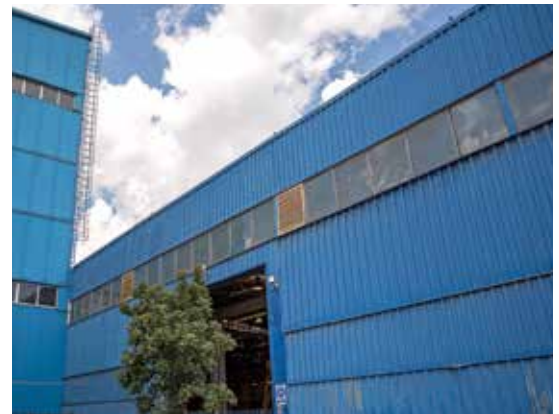
Our manufacturing facility in Radom, Poland with 24/7 manufacturing capabilities