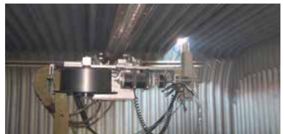
If the damage is extensive, an automatic Unifuse weld overlay should be performed to reinstate the required weld overlay thickness