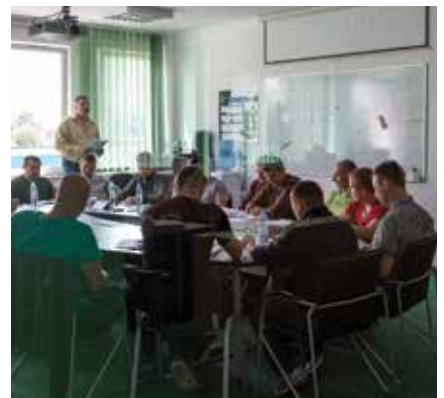
Training of employees